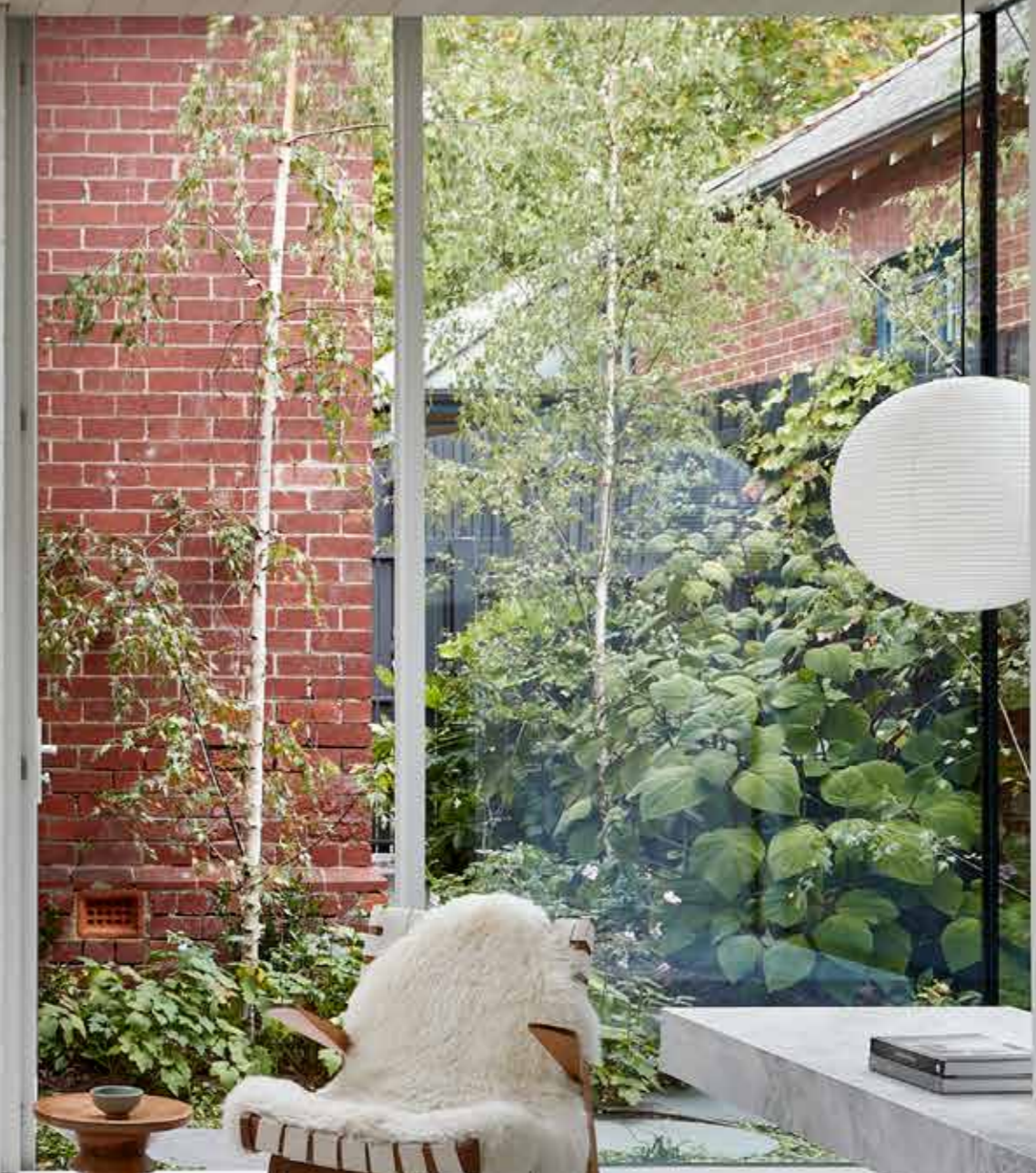
LIVING Brickwork painted Dulux Natural White. Vitra 'Akari' pendant light. Vintage Danish timber bookshelves, owner's existing. Muuto 'Kink' vase and 'Puppy' object by Eero Aarnio, Living Edge. Architectmade wooden bird, Top3. 'Goblet' planter A in Juniper, Lightly. 'Aalto' vase in Clear, Iittala. 'Assembly' vessel in White and 'Golden' building set, Oh Hey Grace. Douglas Snelling armchair. Eames walnut stool, Living Edge. Elba marble ledge, Artedomus. Polished concrete veneer flooring, Pangaea Floors.