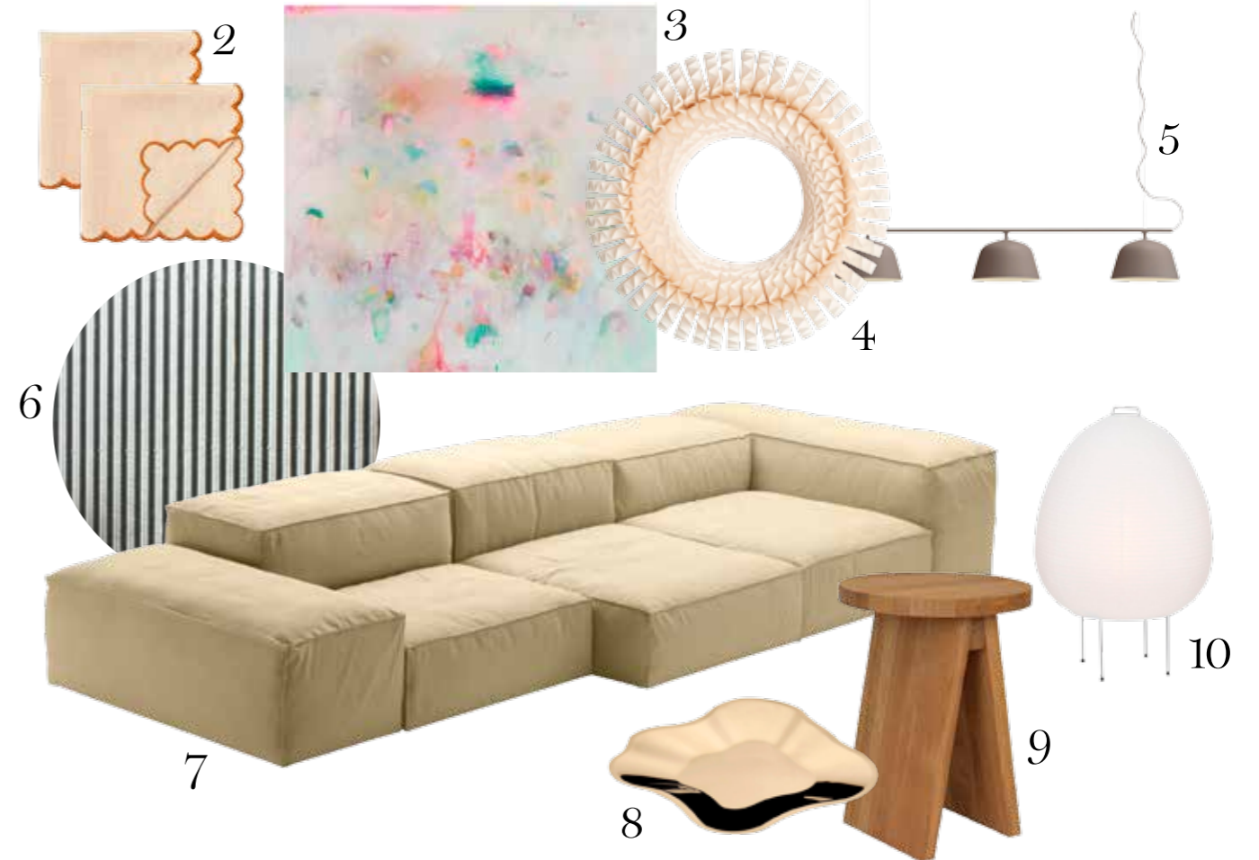
Produced by Andrea Healy.

Offset Mid-century style furniture pieces with a supporting palette of natural textures and soothing hues.