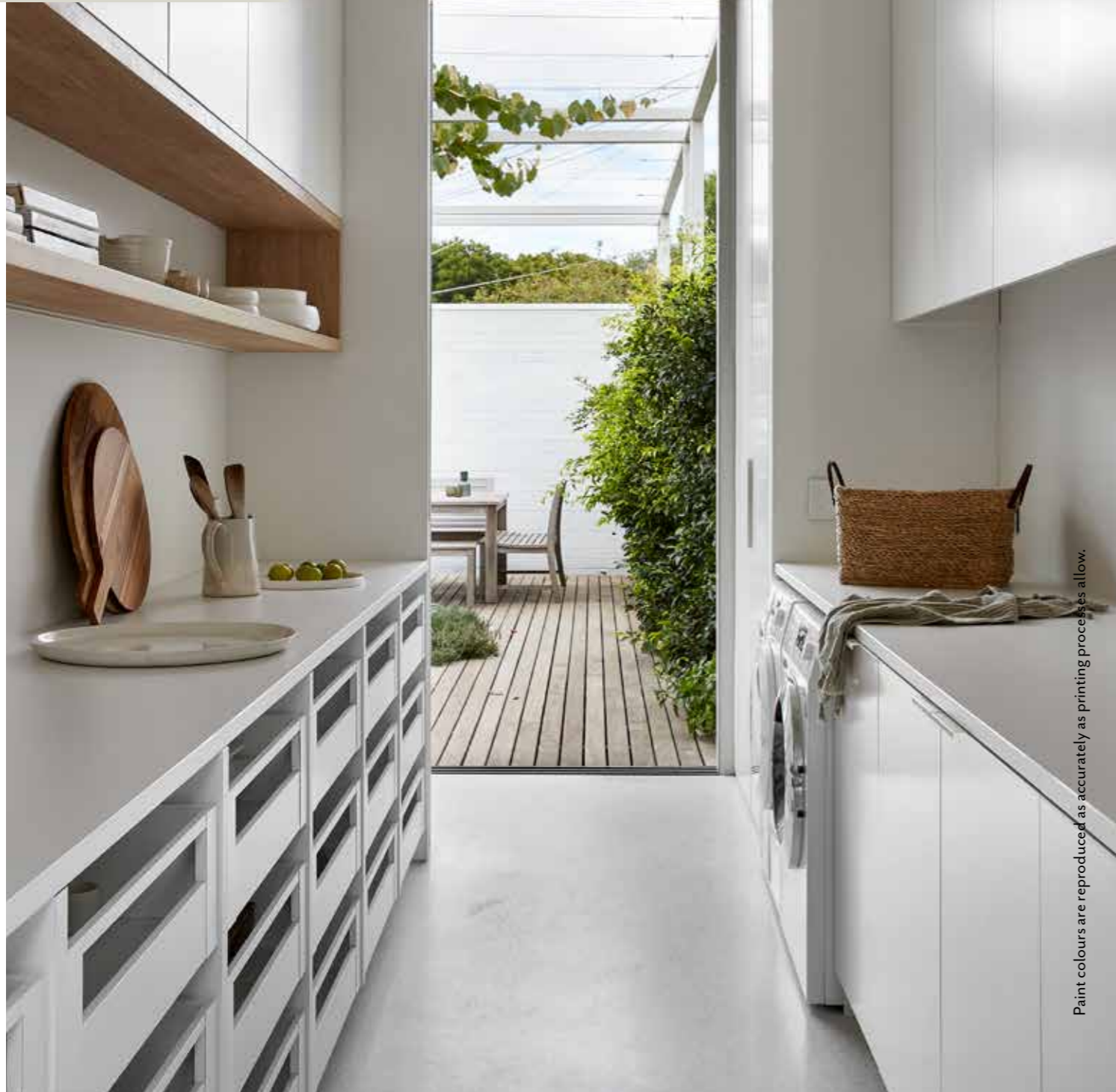
Paint colours are reproduced as accurately as printing processes allow.

LAUNDRY/BUTLER'S PANTRY A dual function laundry and butler's pantry makes efficient use of the space behind the kitchen and leads out to the backyard. Joinery in Dulux Natural White. Pressed porcelain benchtops, Artedomus. Miele washer/dryer, Winnings. Cheese platter, Mud Australia.